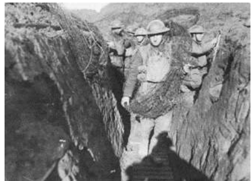
Photo of WW1 Canadian soldiers in the trenches.

The army had difficulty providing rations, called "rats" at the front. The men did not usually receive fresh meat and bread. Instead, they had hardtack, a long-life army ration, such as bully beef (tinned corned beef) and stale biscuits. They suffered from trench mouth caused by poor dental hygiene. After standing in the mud for days, soldiers lost feeling in their feet. After days, their feet would begin to swell and get infected. Their feet would turn red and burn as though on fire, which led to soldiers being unable to walk or fight. Soldiers had to crawl their way to field dressing stations.