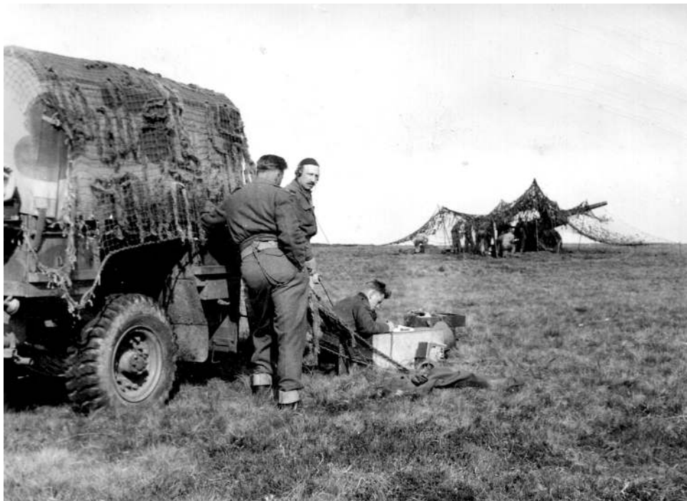
A photo of the 1st Medium Regiment in England dated 1943.

The Canadian Army formed brigade-sized artillery formations called Army Group Royal Artillery (AGRA). They centralized the medium and heavy artillery to the Corps and Divisional level. They also assigned the Medium Regiments to support smaller functions as needed. The Medium Regiments were at full strength with 16 guns. The six Canadian Medium Regiments served in England, Italy, and Northwest Europe during WW2. The six regiments included the 1st, 2nd, 3rd, 4th, 5th, and 7th.