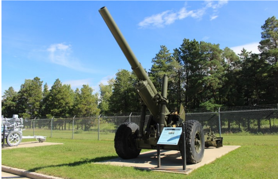
Shown above, the 5.5 Inch Howitzer in front of the RCA Museum.

The RCA Museum has a 5.5 Inch Howitzer MKIII located across from the museum entrance. Our gun includes carriage #863 and barrel #7041, made in 1942. It is an imposing gun with a distinctive set of vertical metal springs below the cradle. The 5.5 Inch Howitzer is commonly absent from the discussion about Canada and the Second World War. In my view, the 5.5 Inch Howitzer, along with the Canadian Medium Regiments, had pivotal roles to play during WW2.