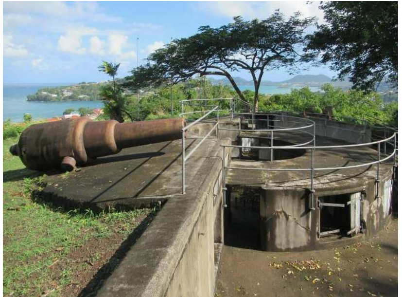
Photo of the La Toc Battery with one of the coastal defense guns.