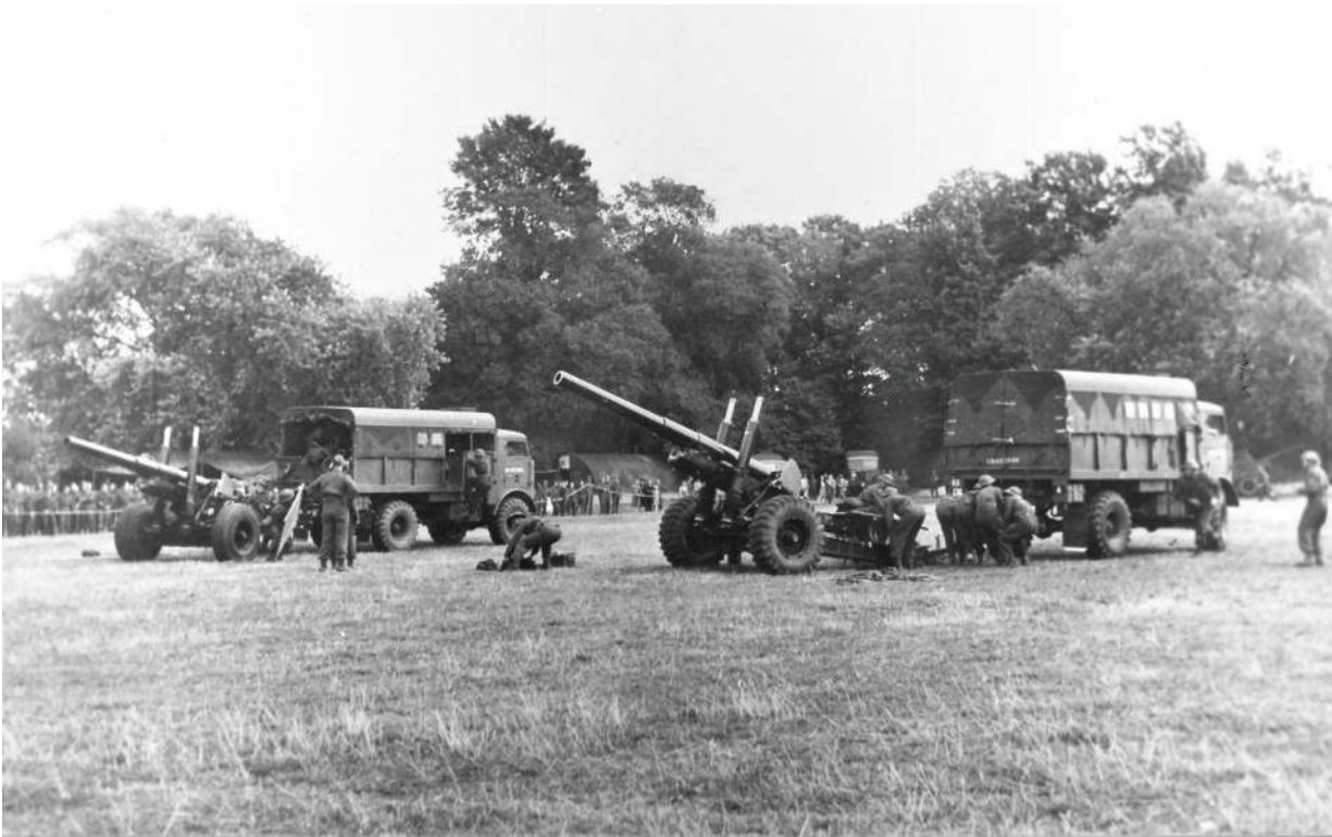
A photo of the 4 th Medium Regiment with two 5.5 Inch Howitzers in England, 1943-44.

The Sicilian Campaign was the first divisional-level combat operation with participation from the Canadian divisional artillery. Operation Husky included Canadian Gunners in the hills of Sicily, developing their winning formula. Canadian Gunners started with no combat experience and developed a wartime formula that succeeded in mainland Italy and Northwest Europe. The 5.5 Inch Howitzer added a much-needed punch against the German forces and proved instrumental in the war. The Allies fired over 2,600,000 rounds with the 5.5 Inch gun between D-Day and VE-Day.