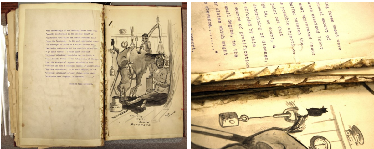
Figure 2: Initial condition (2007); binding disintegrated; detail of damaged spine and prior repairs

Although revered and protected, the scrapbook was accessed regularly over the decades (for example, during Junior Officer Courses) and was in poor overall physical condition. The binding had deteriorated; some pages and items were detached at risk of loss. A number of previous repair attempts were of questionable quality. Any future handling could jeopardize both the scrapbook's integrity as well as the significant individual components.