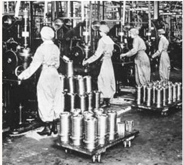
Shown above are women factory workers in a munitions plant in Quebec during WW1.