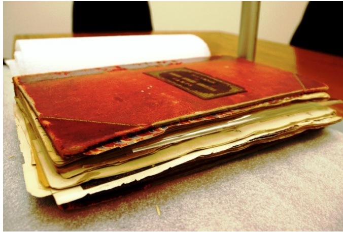
Figure 1: Initial condition (2007): loose pages, brittle paper with minor tears along edges

The RCA Museum is the home of an historic artillery scrapbook, entitled Souvenir of Dominion Artillery Camps , dated 1889-1912. The bound volume contained original watercolours, pencil sketches, historic photographs, original signatures and documentation from this formative period of The Royal Regiment of Canadian Artillery (RCA).